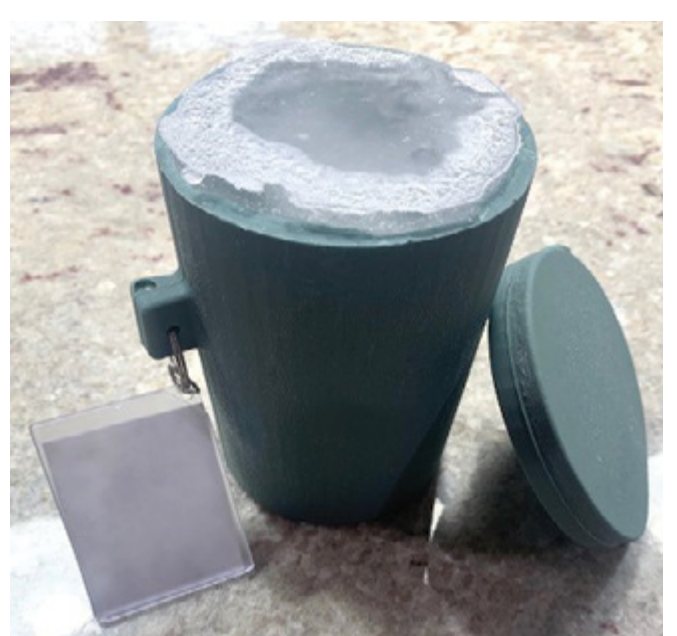
Freeze the Keys! 😥

Central Arkansas VA Healthcare System Sabah Ocasio